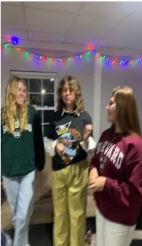
Youth Christmas Party