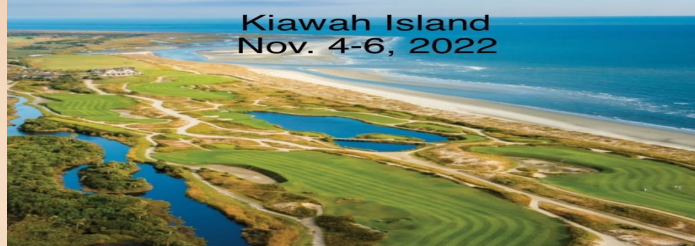
Kiawah Island Nov. 4-6, 2022

We have a great group of kids that are eager to hear God's word, share their experiences and of course enjoy a few minutes of play! We have recreation covered but need help with Bible lessons. The curriculum is available if you are interested. Please email the office, info@gracechapelbaptist.net , if you are interested in signing up for a night. Don't miss out on this opportunity to invest in our kids!